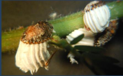
An Illustrated Overview of Species with special reference to Homopteran Pests.